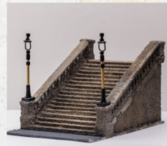
都爹利街石階及煤氣路燈 Duddell Street Steps and Gas Lamps