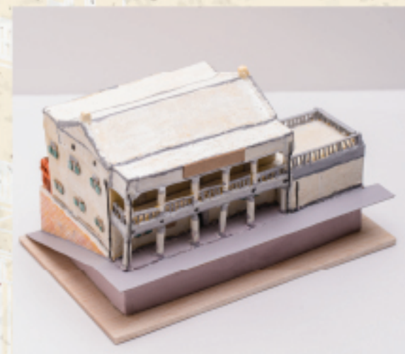
鄭芷滢 CHENG Tsz-ying